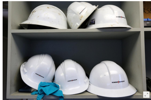
FILE PHOTO: Helmets line a shelf in a control room at Kinder Morgan's Westridge Terminal on Burrard Inlet in Burnaby, British Columbia, Canada November 17, 2017. Picture taken November 17, 2017.

A few weeks ago we received the devastating news that a Travis County District Court ruled the Texas Railroad Commission isn't required to set standards for routing pipelines that have the power of eminent domain. This is something that I fought for throughout the entire 86th Legislative Session.